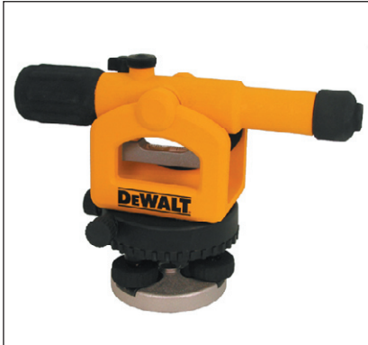
Painted Z Corp. model of a DeWALT Auto Leveling Transit