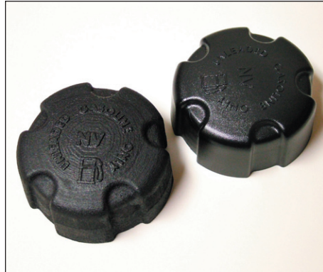
Fuel Tank Cap and Prototype Printed with ZPrinter 310 Plus

Aesthetics isn't just for fine art anymore. Consumers care deeply how their products look, even utilitarian ones like Powermate Corp.'s gas-powered air compressors, pressure washers, generators and backup power systems. Plain old rectilinear sheet metal has given way to sleek injection-molded plastic parts in these products, not only for function but for improved shelf appeal.